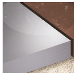
NO CONCRETE DISCOLORATION