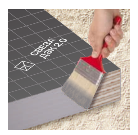
BETTER WATER RESISTANCE OF EDGES