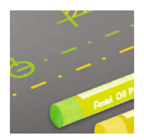
EASY TO MARK OUT