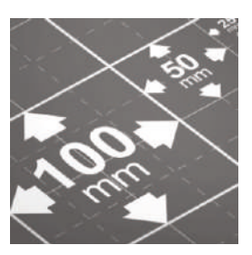
RULING GRID ON SURFACE