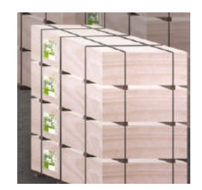
PACKED AS STACKS ON WOODEN BLOCKS

**30% less water absorption in the Cobb test