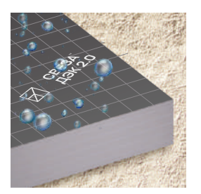
BETTER WATER RESISTANCE OF COATING**